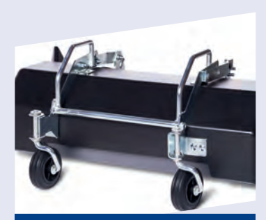
PLASTIC SWEEPINGS COLLECTOR

Your satisfaction is important to us. Consequently, we offer an extensive range of accessories that facilitate work in any season and in any weather