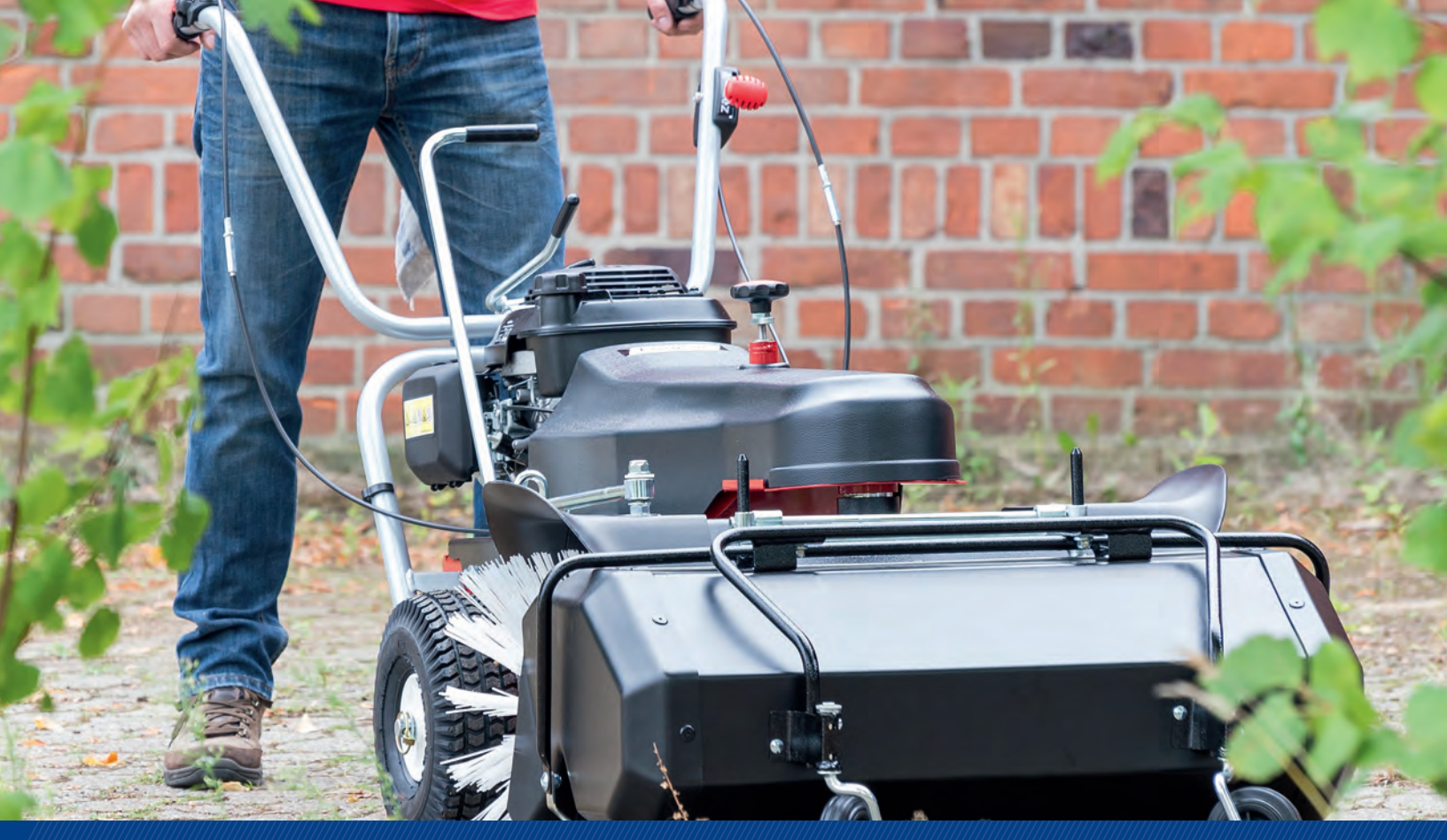
INFORMATION ABOUT THE COMPANY