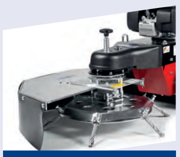
ATTACHMENT WEED BRUSH