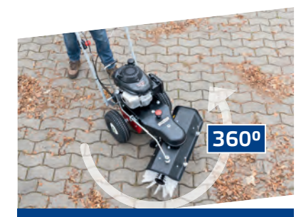
360° FREEWHEEL DRIVE