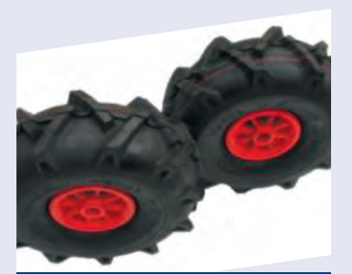
AGRICULTURAL TREAD PROFILED WHEELS