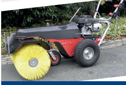
Optional: disk brushes