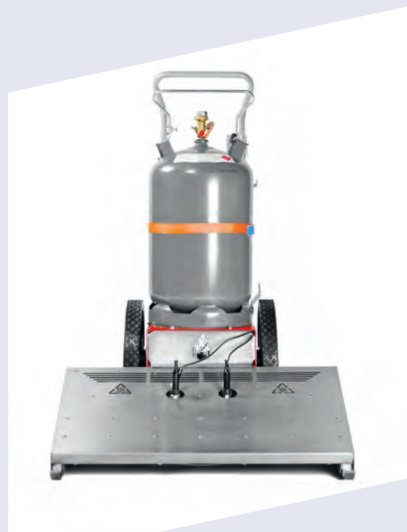
SPECIAL THERMAL INSULATION