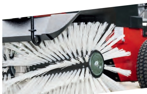
40 CM BRUSH DIAMETER