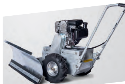
FEED PUSHING BLADE