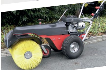
Optional: disk brushes