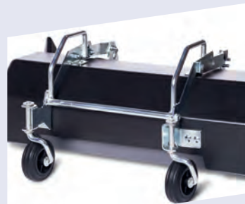
PLASTIC SWEEPINGS COLLECTOR

Your satisfaction is important to us. Consequently, we offer an extensive range of accessories that facilitate work in any season and in any weather