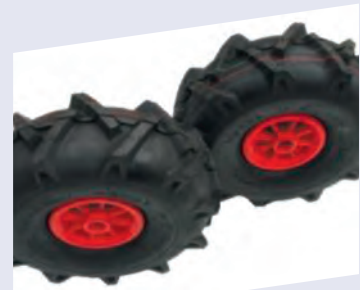
AGRICULTURAL TREAD PROFILED WHEELS