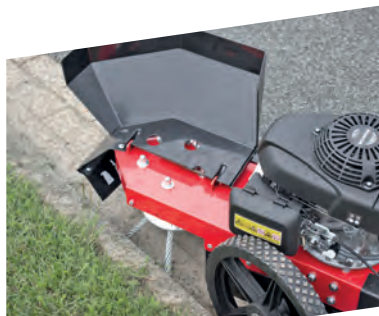
LATERALLY PIVOTING BRUSH For convenient work on edges.