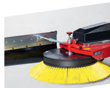
RADIAL WITH SWATH FORMER