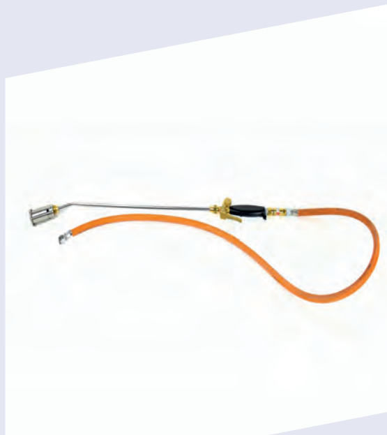
ACCESSORIES : HAND BURNER