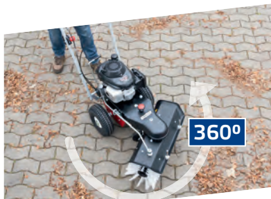
360° FREEWHEEL DRIVE