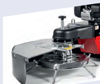
ATTACHMENT WEED BRUSH