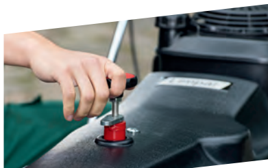
CENTRAL BRUSH HEIGHT ADJUSTMENT