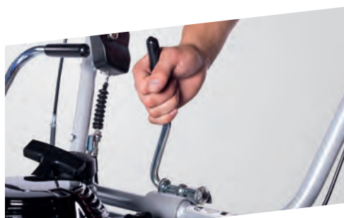
CENTRAL HANDLEBAR HEIGHT ADJUSTMENT